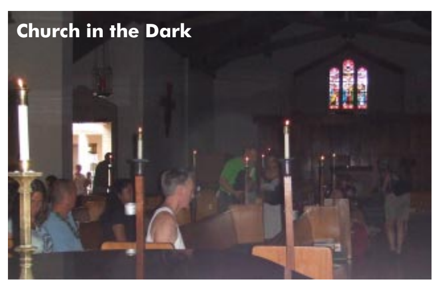
Read the complete story about LCH's services following the earthquake and power outage on the website, www.lchwelcome.org.

Please consider volunteering some time and energy to the Property Committee for a morning work session or for more long -term participation. Lately, it has been a committee of one. Your time and energy are essential — tools and experience are useful, but not necessary. It is a great feeling to know that a job is done and well done