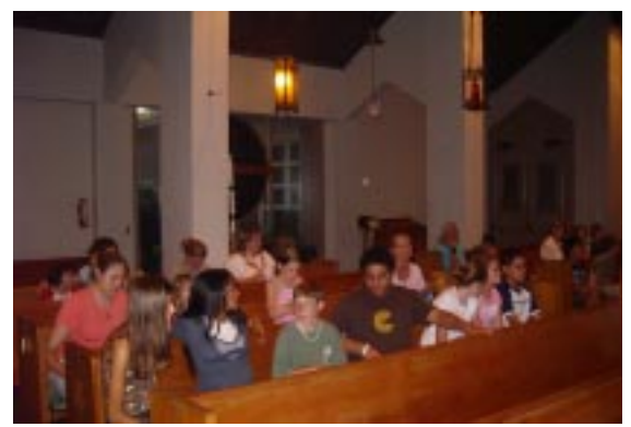
A Youth Hukilau event was held at LCH in November.