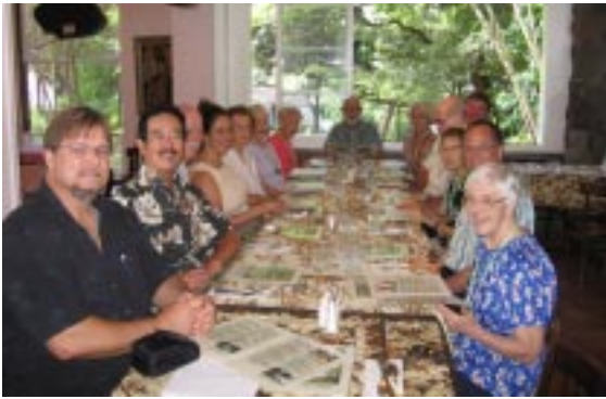
More photos of the Ohana Gathering below