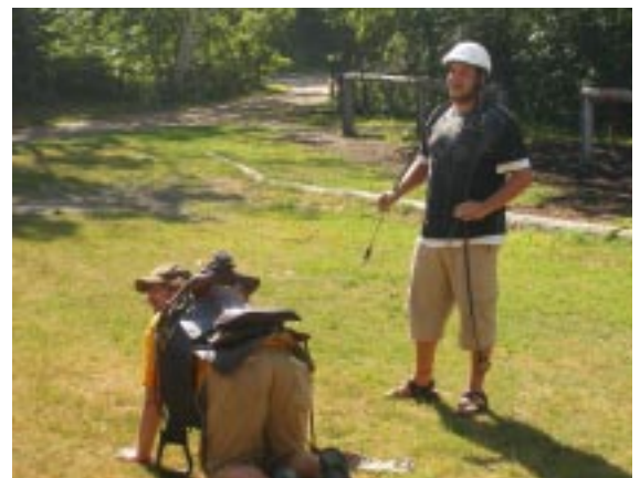
Learning how to ride a horse at Camp WAPO