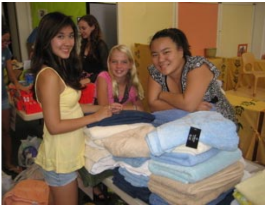
Several LCH youth helped with the ingathering for Operation Backpack at Calvary by the Sea Lutheran Church.