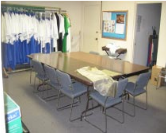
The Board Room before and after refurbishing.