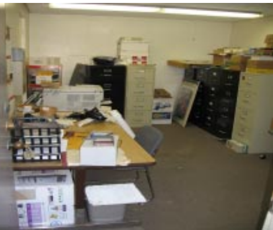
Counting Room before and after refurbishing.