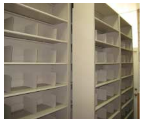
New shelving was installed in the Music Storage Room on September 8. These beautiful new shelves will soon be filled with the extensive LCH music library.

Stay for the Hilton Hawaiian Village fireworks at 8:30 pm. They're awesome!