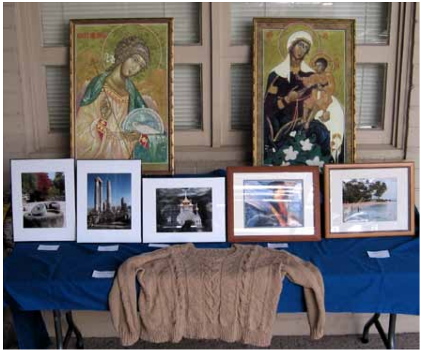
A few of the arts and crafts by members and friends of LCH displayed as part of the annual Faith & Arts Sunday celebrated this year on Sunday, February 15.

I encourage all of you to enrich your Lenten journey by taking advantage of these many opportunities.