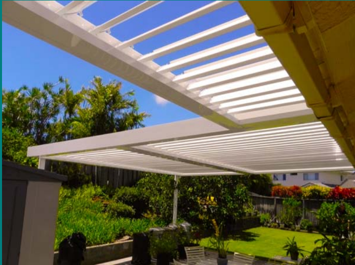
5. Trellis / Louvered Roof