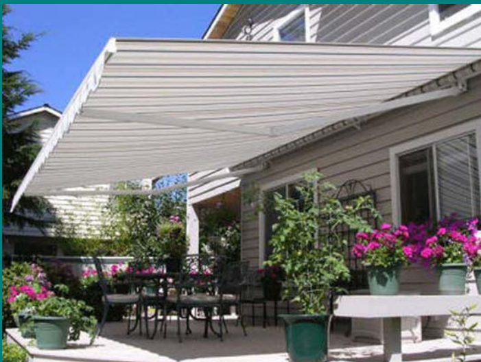
4. Retractable Fabric Awning