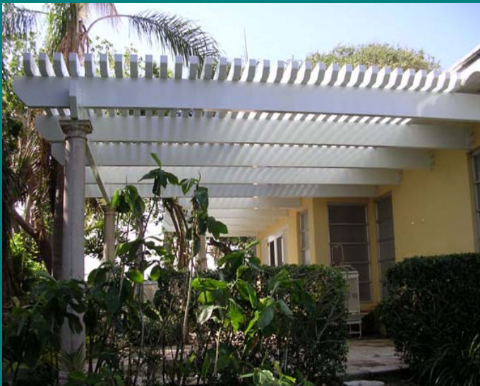
6. Standard Structural Roofing