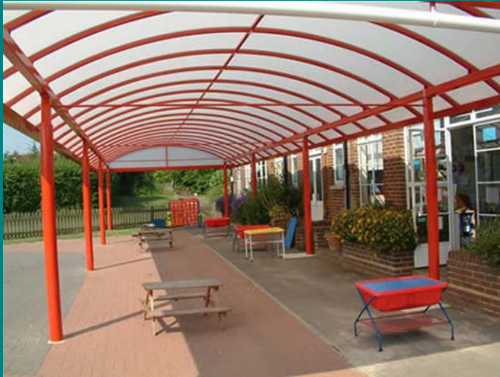
3. Aluminum Frame and Fabric