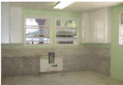
The Kitchen: After