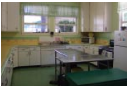
The Kitchen: Before