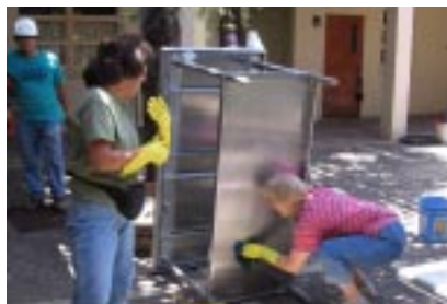
Scrubbing the stainless steel.