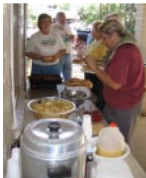
Lots of food for hungry workers!

The handicapped ramp is a pile of rubble!