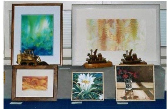
Last year's display for Arts and Faith Sunday.

By February 7 — the item(s). It will be kept in a safe place until displaying it on February 10.