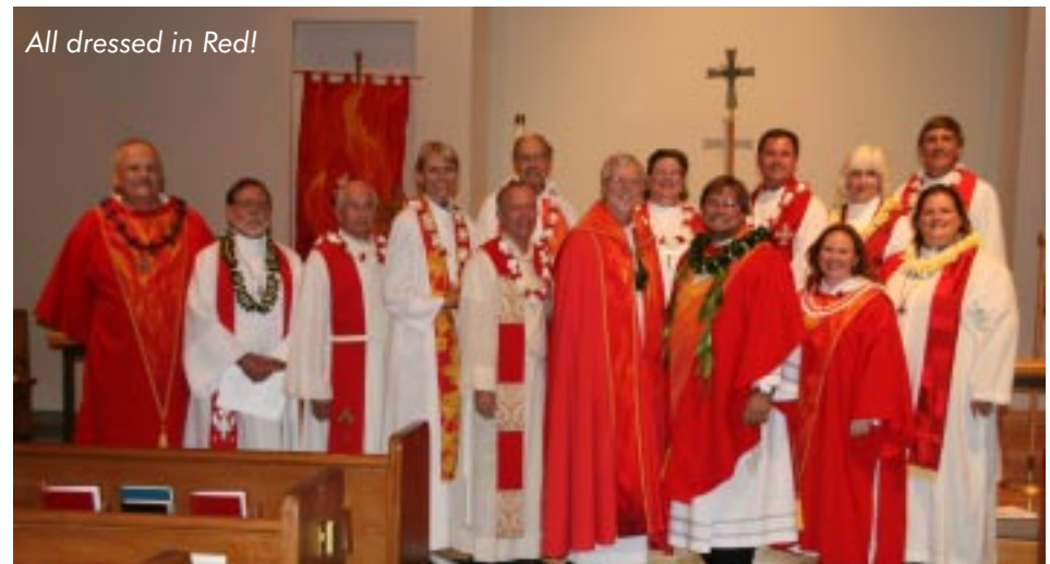
All dressed in Red!