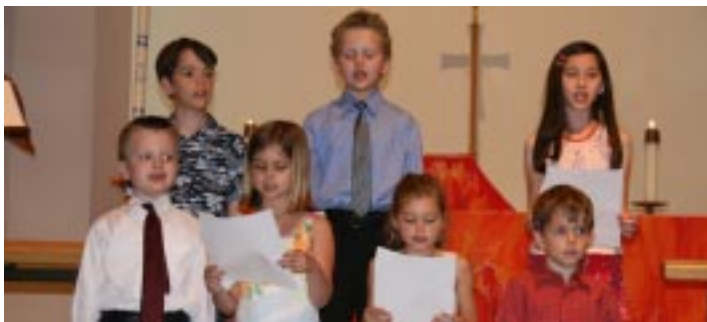
(Above): Children sing "One Ohana" following the second reading.