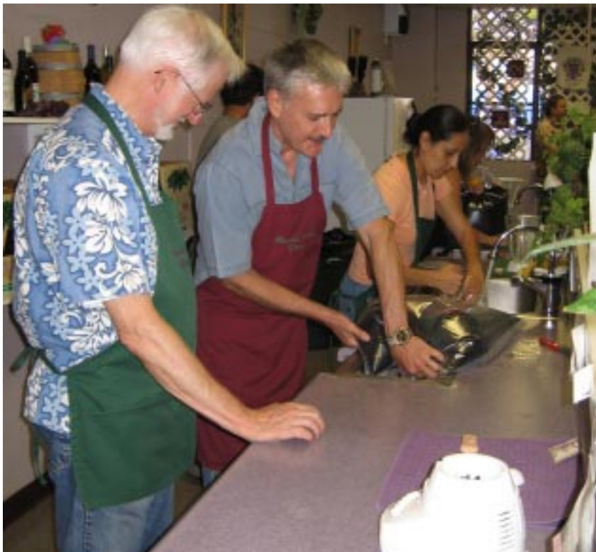
The Mary Magdalene Society gathered at the Diamond Head Winery on May 12 to make wine for next fall's Luther Fest.

Thank you so much for your willingness to help us! We really appreciate you, the members and friends of The Lutheran Church of Honolulu.