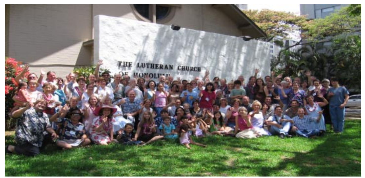
Members assembled to shoot a new photo for the LCH website

that allow subscription via iTunes or using other RSS (Really Simple Syndication) software. You can also go directly to the iTunes Store and search for us in the "Religion & Spirituality" section of the podcast directory. If lots of us subscribe via iTunes or tell our friends, we can rise up higher in their popularity index.