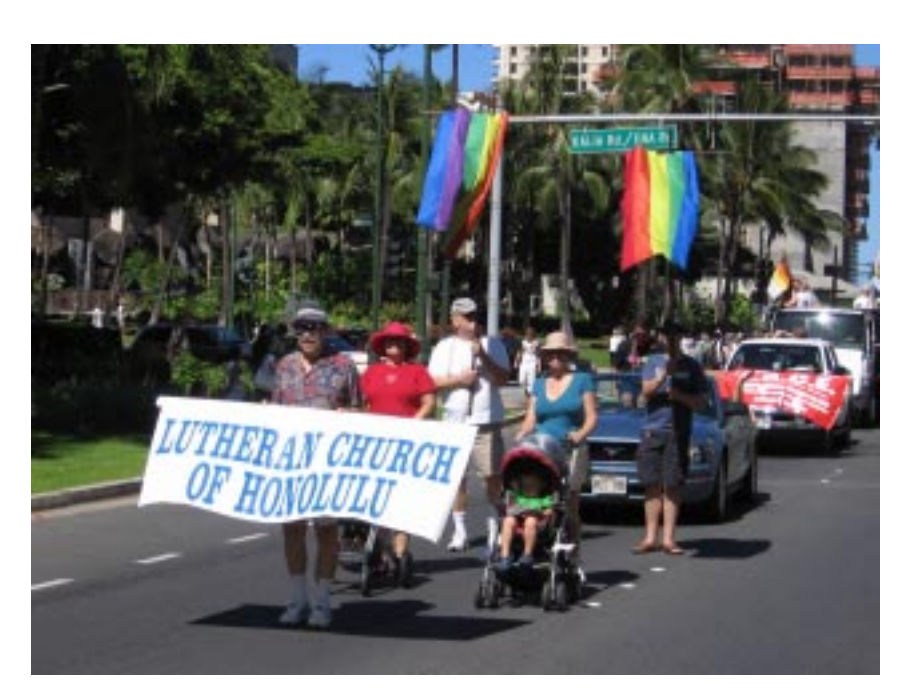
LCH contingent in the Gay Pride Parade