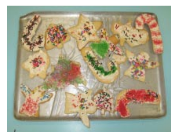
Don't they look delicious! Even though the children ate some of the cookies, there were plenty left for the whole congregation to enjoy. Following worship, Chuck Huxel delivered cookies to our kupuna.