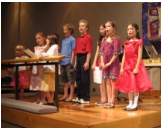
The F.R.O.G.S. Choir sang as part of the Children's Benefit Concert to raise $5,000 for an Ark of Animals from Heifer International.