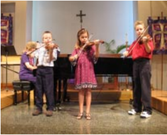
Three children joined together in "Allegro" by Shinichi Suzuki.