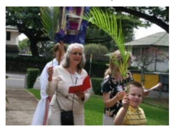
The Palm Sunday Procession