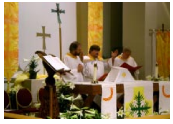
Alleluia, Christ is risen!