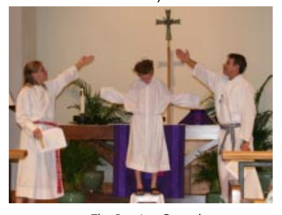
The Passion Gospel