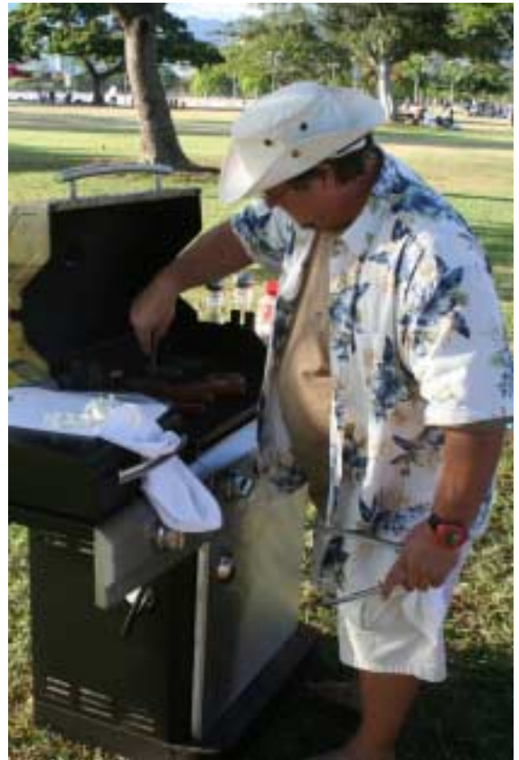
Pau Hana Friday down at Magic Island. Mmmm. What's the pastor grillin'?