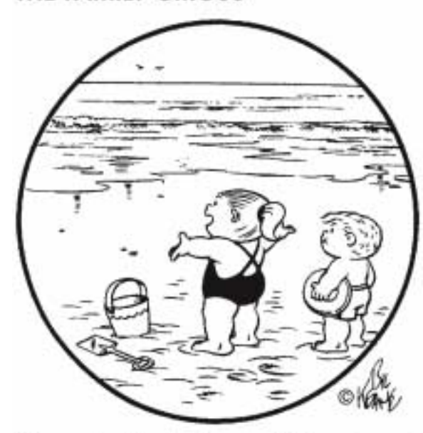
"Every day God lets some of the water out so there's room to play on the beach."

from JoyfulNoiseletter.com Reprinted with permission of Bil Keane