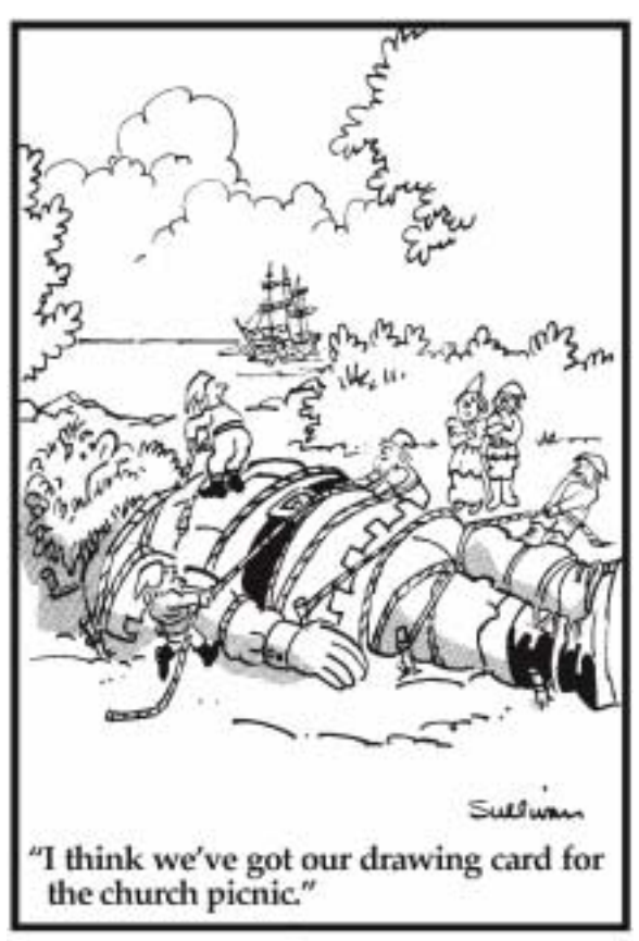
from JoyfulNoiseletter.com Reprinted with permission