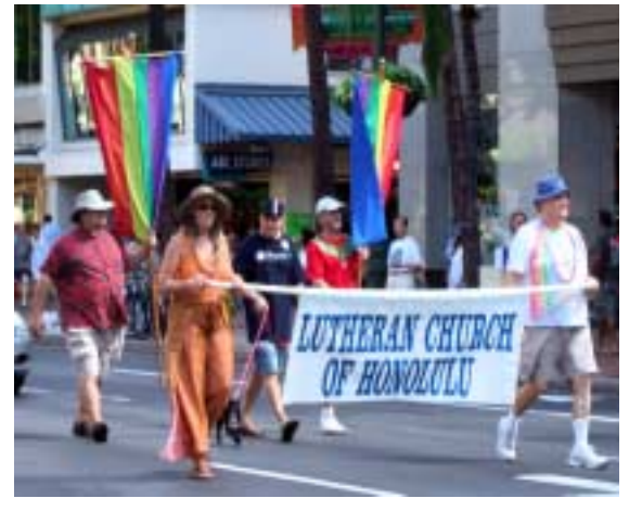
LCHers marching in the Gay Pride parade.

Finally, I gave two Adult Forum presentations on the LCH website in July. The third session—create your own web page—will be offered on August 3. Bring your laptop if you have one, along with some text and a digital photo for your page. If you don't have a laptop, we will provide some loaners. Come and join the fun.