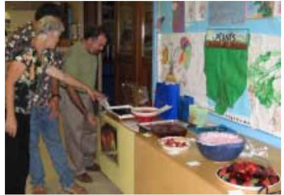
Checking out entries in the Red Jello Contest at LutherFest. Visit the website for more pictures.