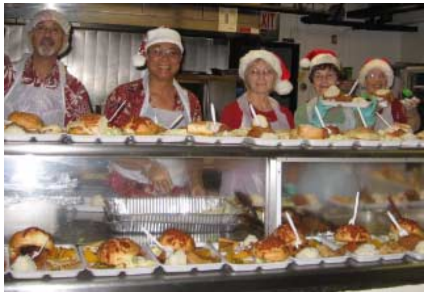
The LCH IHS crew donned Santa hats to serve dinner at IHS—Honolulu's homeless shelter—on the Friday before Christmas.